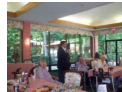
Potomac Woods Town Hall/Ice Cream Social September 4, 2009

Discussions at the ice cream socials reaffirmed Supervisor Principi's commitment to find a lasting solution for senior transportation. As a community, we need to insure that senior citizens are provided a variety of transit options once they are no longer able to drive.