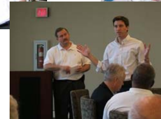
Metro Extension Press Conference