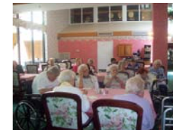
Potomac Place Town Hall/Ice Cream Social August 10, 2009