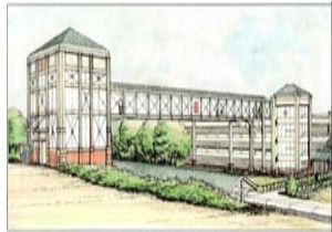
Woodbridge Station expansion rendering

The Virginia Railway Express station in Woodbridge will have a second platform by December, making it easier and safer to access the trains.