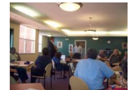
Envoy Town Hall/Ice Cream Social September 16, 2009